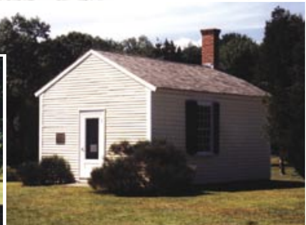
❖ Daniel Webster's Law Office