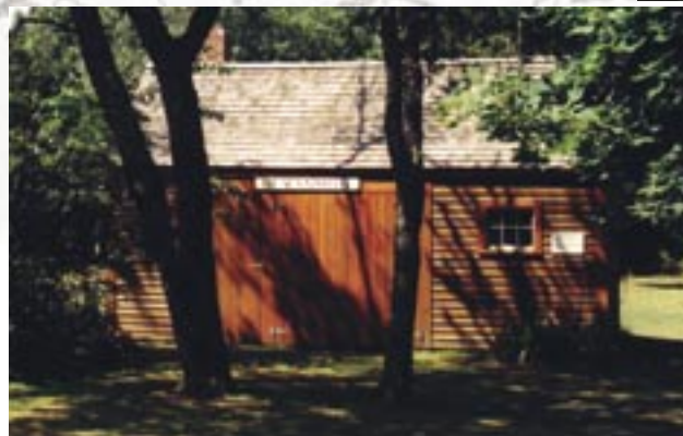
❖ Working Blacksmith Shop