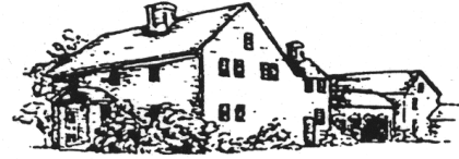
ISAAC WINSLOW HOUSE - 1699