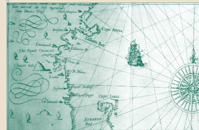
Captain Christopher Jones of the Mayflower could rely on the first map of the region "New England" by Captain John Smith who in 1616 published it to promote colonization. "New England Die mercklichsten dtheile..." (Frankfurt-am-Main, 1617)

Take a tour of Daniel Webster's birthplace in Salisbury, New Hampshire. The Massachusetts Audubon Society and the Winslow House team up for a great day trip.